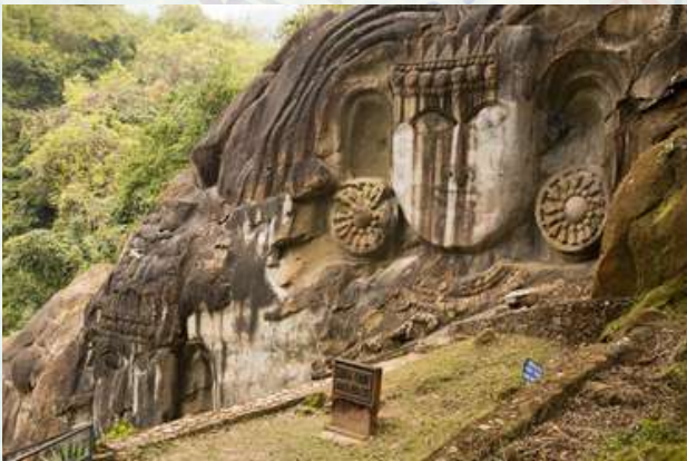
Unakoti Rock Carvings