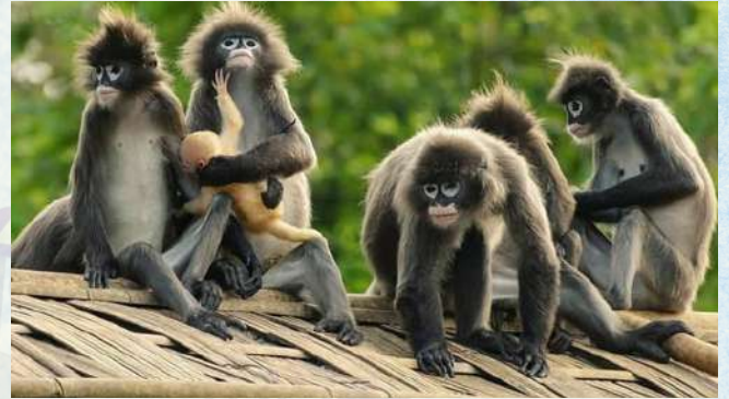
Sepahijala Wildlife Sanctuary