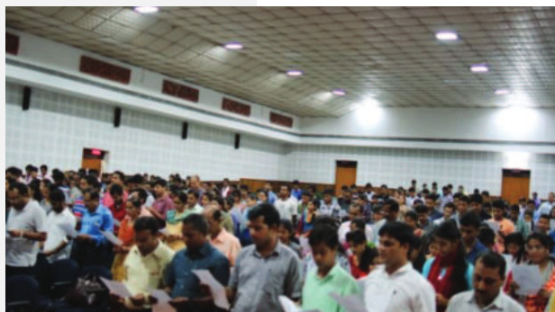
New India Pledge by Teachers, Offices, Students of Tripura University

Tripura University observed ‘Swachhata Pakhwada’ from 1st –15th September 2017. Accordingly, a host of programmes for the fortnight have been undertaken to rejoice the occasion.