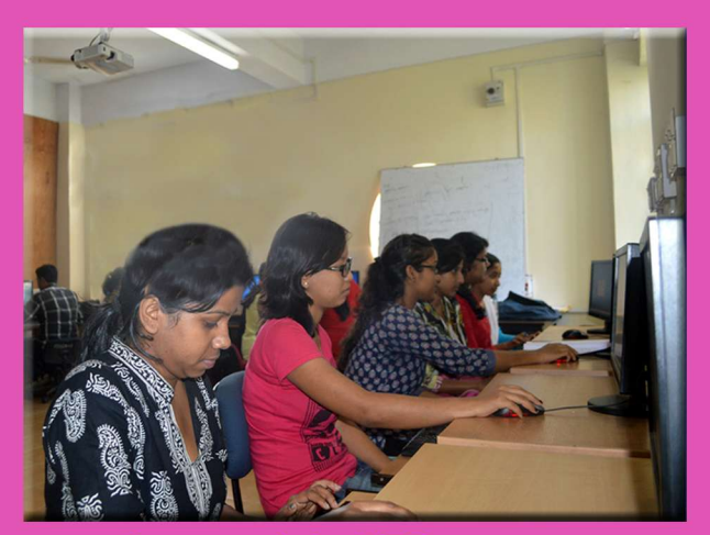
Computer Lab of IT Department