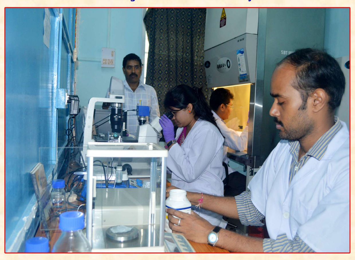
Lab of the Biotech Hub