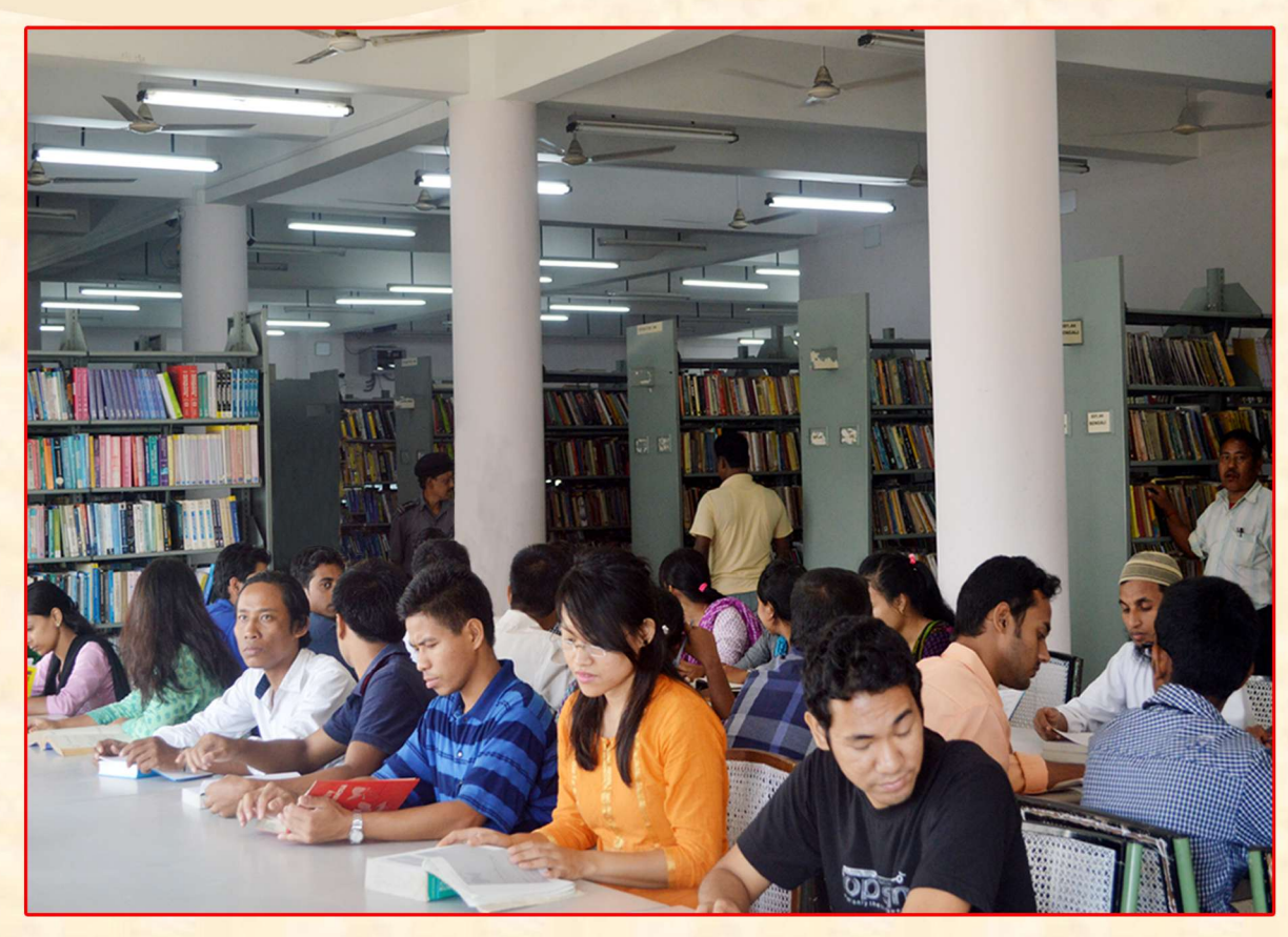
Reading Room of the Central Library