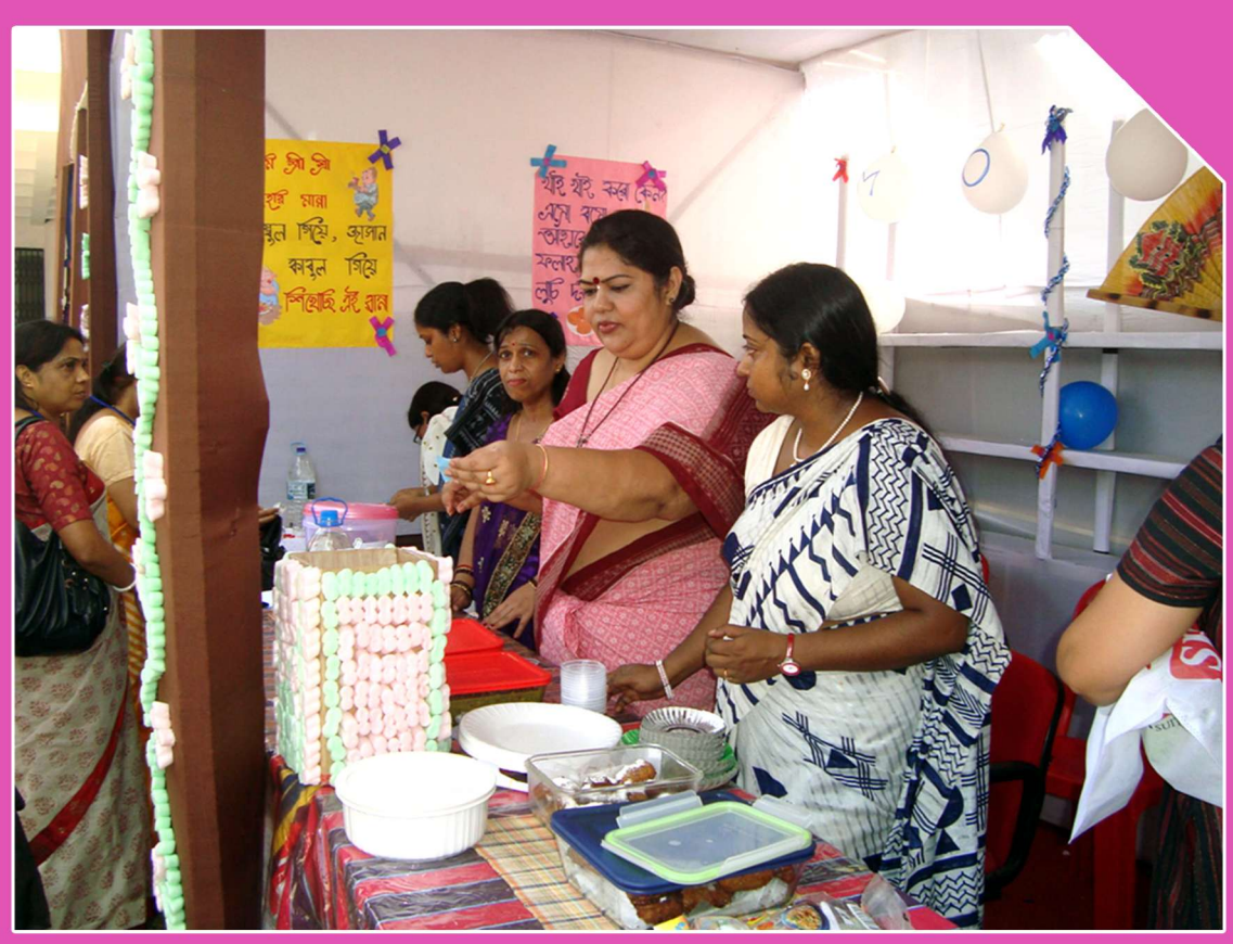
Food Stall of "Mohana"- Women's Association of Tripura University in the Cultural Festival: UDBHAAS-2013