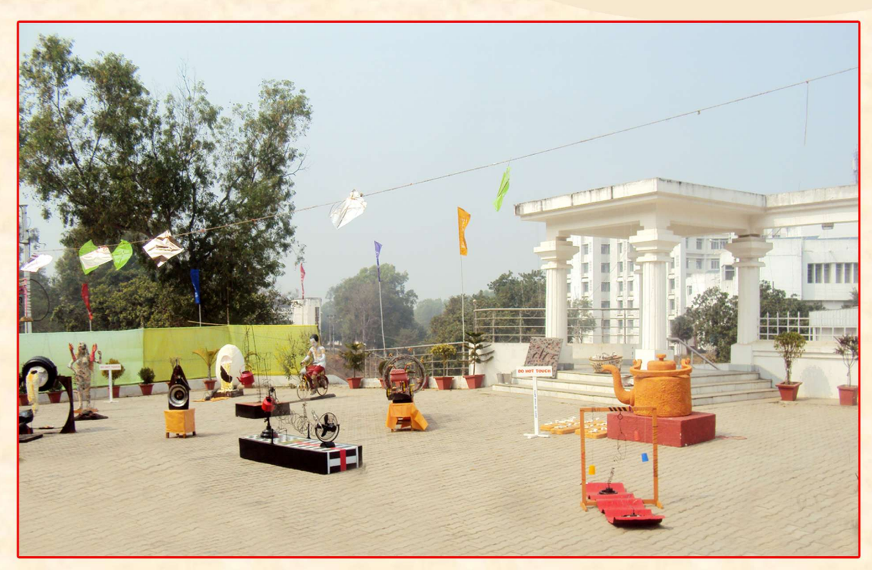
Arts Exhibition by the Department of Fine Arts