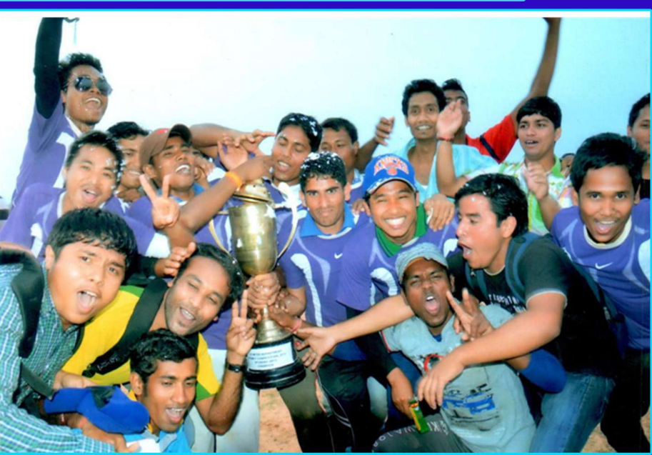
A Glory of Joy