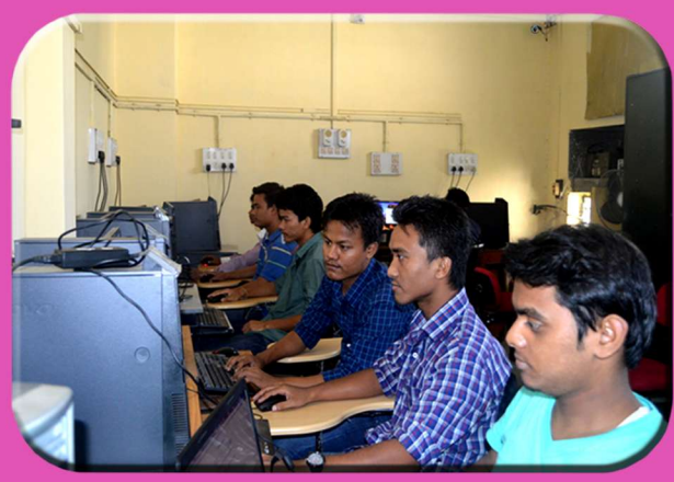
Computer Centre of the University