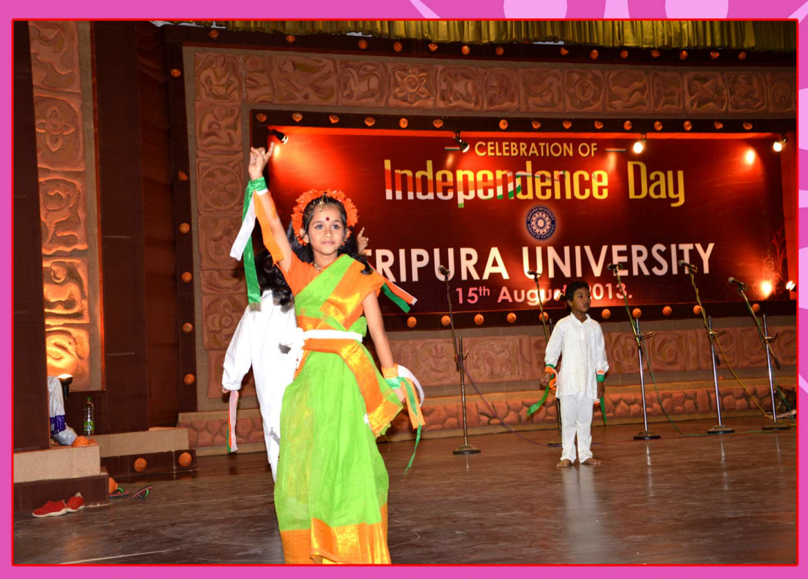
Cultural Programme on Celebration of Independence Day, 2013