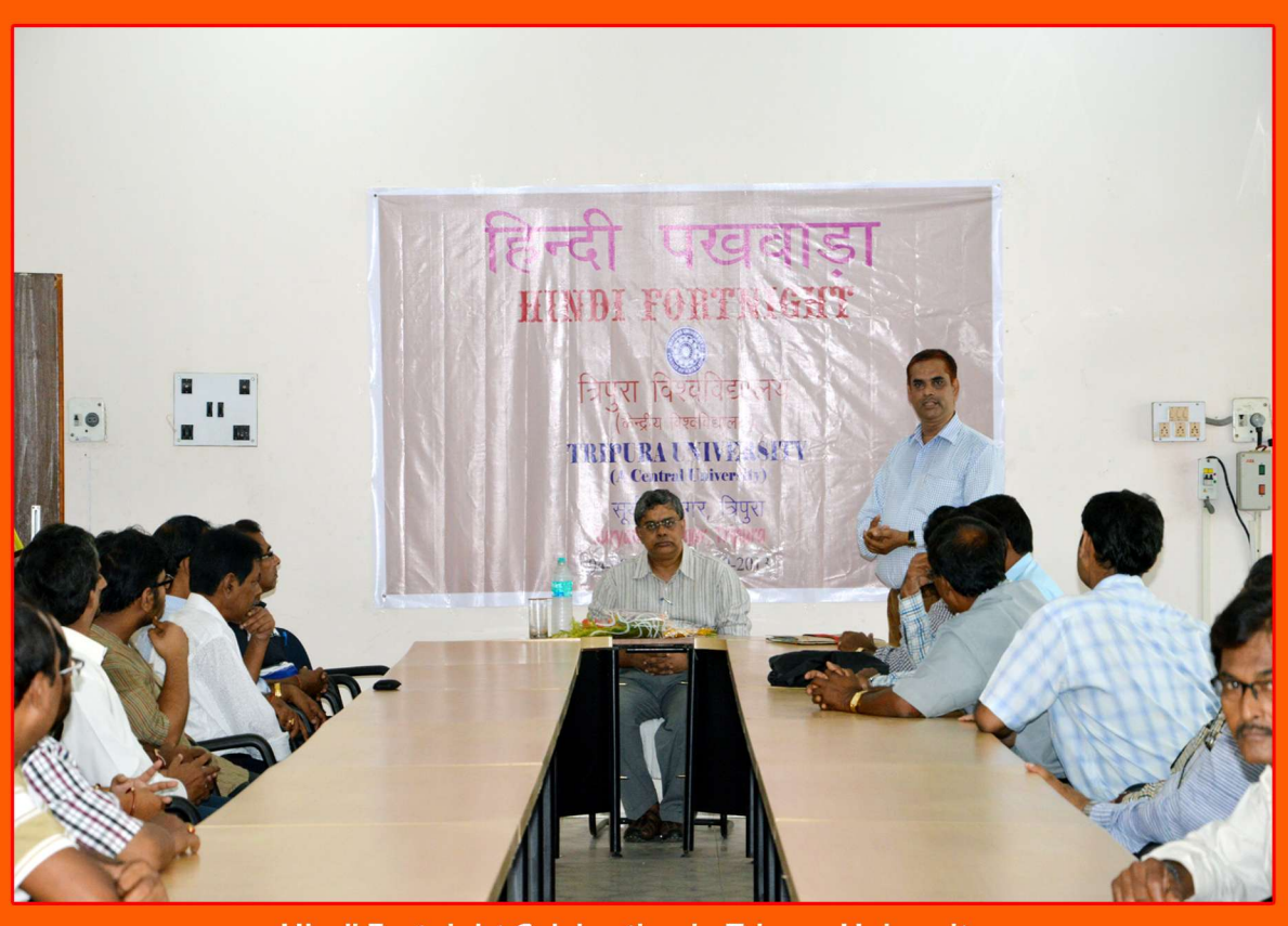
Hindi Fortnight Celebration in Tripura University