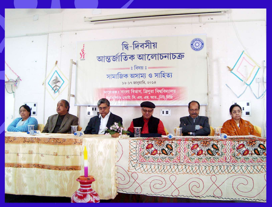
International Seminar on "Social Inequality and Literature" organized by the Department of Bengali