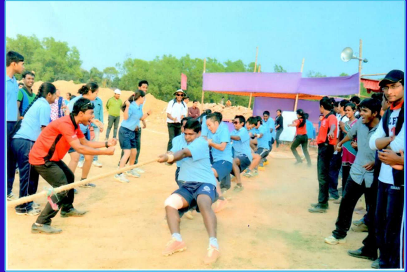
Tug of War