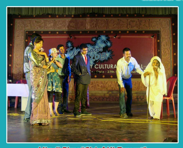
Hindi Play "Chief Ki Dawat"